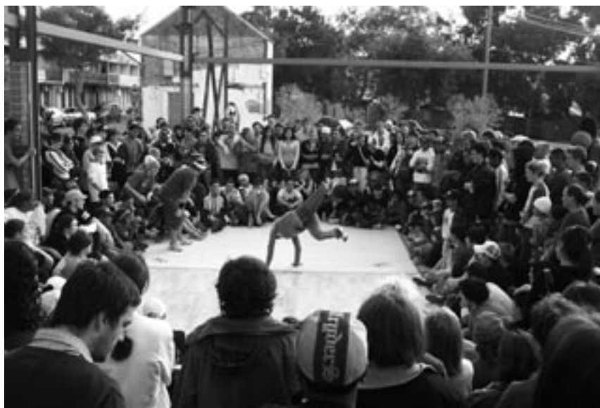
Entertaining the crowd outside Redfern Community Centre.

The Government has started discussions with the Aboriginal Housing Company ( www.ahc.org.au ) which has its own plan for The Block, called The Pemulwuy Project. The AHC is not satisfied with discussions so far, and has appointed its own Pemulwuy Vision Task Force, chaired by Tom Uren (former Federal Minister responsible for some of the most innovative urban planning schemes of the 1970s) to provide an independent professional assessment.