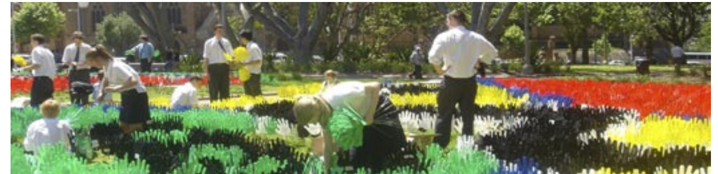
School students at the Sea of Hands in Hyde Park, Sydney, Nov 2004

An archiving project for the Sea of Hands has been initiated.