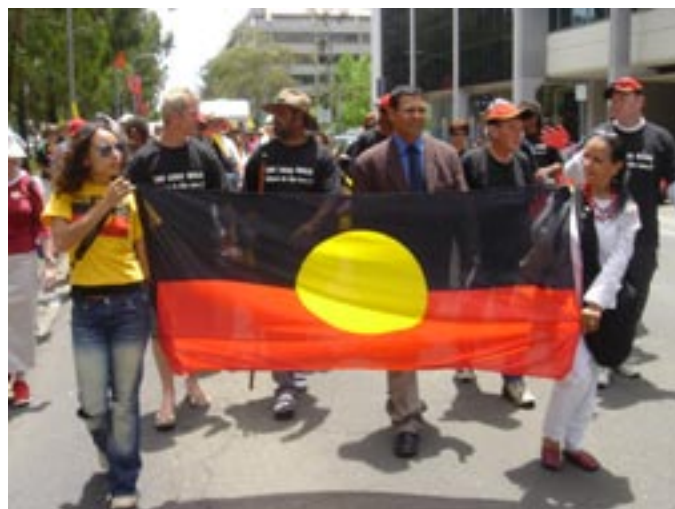
Michael Long with Senator Aden Ridgeway marching to Parliament House on The Long Walk. NSW MP, Linda Burney, and her daughter carry the Aboriginal flag.