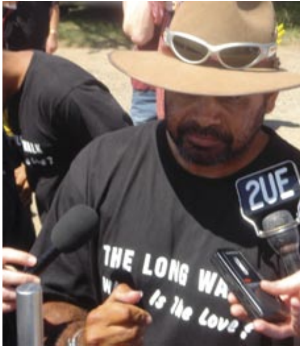
Michael Long's walk to Parliament House put Indigenous disadvantage in the news, Nov 2004.

This report was compiled by ANTaR National. For enquiries please contact our office: tel. 02 9555 6138, email: antar@antar.org.au