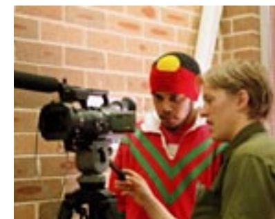
Two ReconciliACTION members film discussion at the Anti-Racism Conference

The Freedom Ride 2005 left Sydney in February 2005.