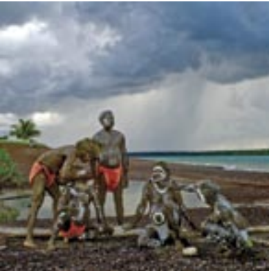
Images from ANTaR's 2006 fundraising calendar.

Other grant opportunities were investigated, including with international foundations. ANTaR will continue to explore opportunities with these sources in the coming year.